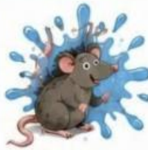
SPLAT THE RAT