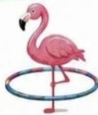
HOOP A FLAMINGO