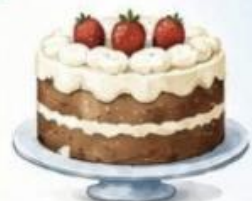
GUESS THE WEIGHT OF THE CAKE