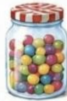
GUESS THE SWEETS IN A JAR