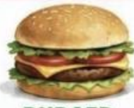
BURGER IN A BUN